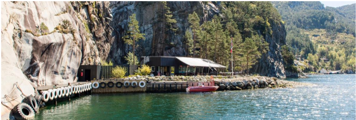
Restaurant Helleren in Lysefjorden

Then at 1600 we again meet in the hotel reception for a short walk to the electric boat Rygerelektra. The boat sails from downtown and will take us on a 3 hour cruise to Lysefjorden, you will see Fantahåla (Vagabond's Cave), the famous Preikestolen where Tom Cruise climbed the sheer mountain face in the movie Mission Impossible 6, and the towering Hengjanefossen waterfall. Then we will arrive the nice restaurant Helleren where it will be served a grill buffet. At 2200 the boat will depart for a 1 hour trip back to city centre.